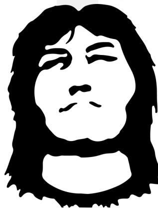
Face of a Worker

The American Fourth Way will be referred to simply as it is written or as A4W, American 4th Way, or the International Fourth Way of America. Our colors are Blue, White, and Black. Below is a list of A4W symbols and their meanings;