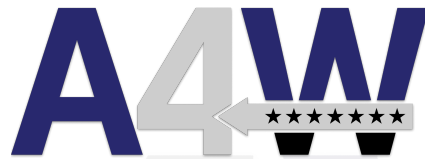
Logo of American Fourth Way Represents the flag, the arrow, and the name of the movement. White is greyed to show up on paper.