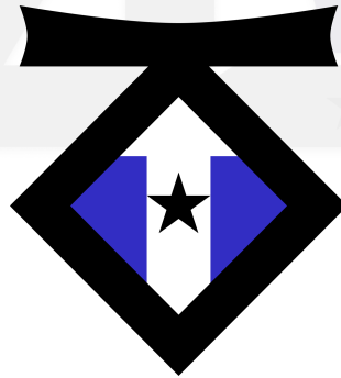
Emblem of the General Staff Displays the forward arrow and the Black Star within a special frame. Represents the General Staff as described in Article V